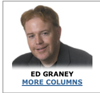
ED GRANEY MORE COLUMNS